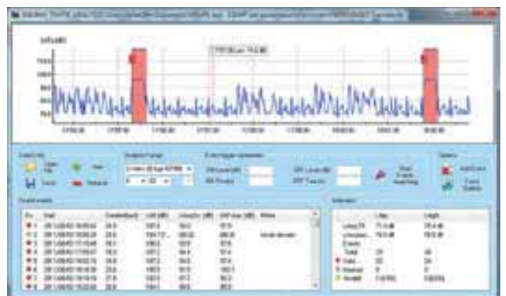
Noise Studio: NS2A “Acoustic Pollution” module; railway traffic noise, 24h analysis with automatic identification of train transits.

Noise profiles detected outdoor, are analyzed in order to search for annoying sources characterized by a sequence of events such as railways and airports. The analysis is performed on a daily basis with a resolution equal to 1/8 of a second and with automated detection and analysis of sound events. This module works on time histories acquired with option “Advanced Data Logger” installed on the sound level meter.