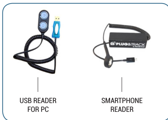
USB READER FOR PC