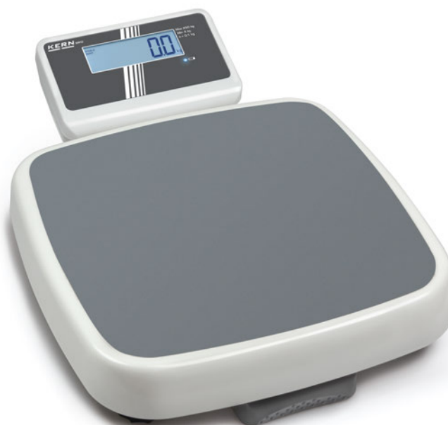
KERN MPD 250K100M

Professional step-on personal floor scales approved as a medical device and with EC type approval class III