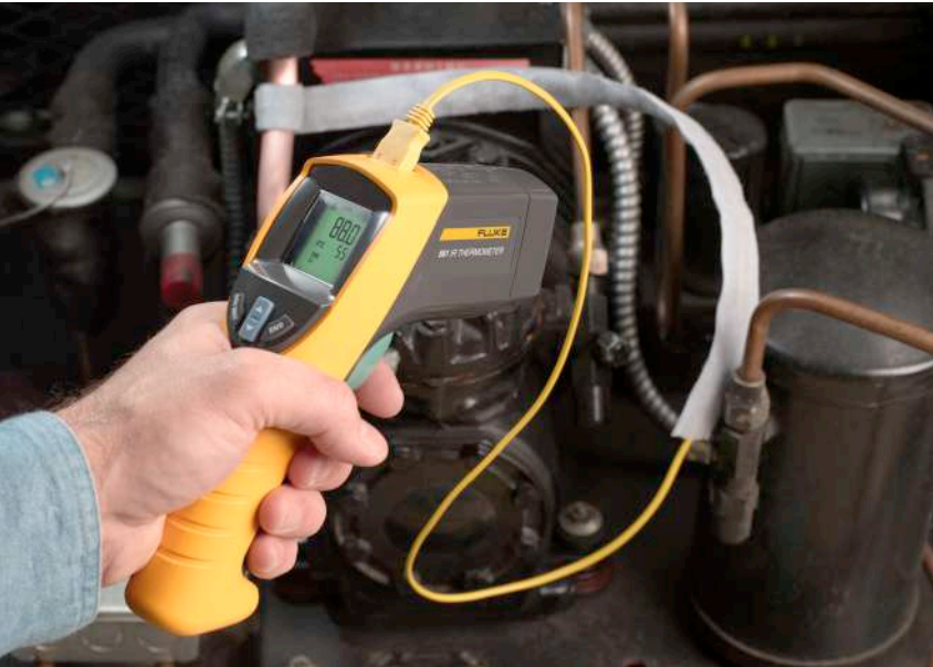
Measuring compressor line temperature with the Velcro K-type thermocouple for the Fluke 561 IR Thermometer.

I attach the Fluke 561 Velcro thermocouple to the circuit 1 liquid line and compare the IR temperature to the contact temperature. By setting the emissivity to "Low", my IR temperature matches the contact temperature. This will make for quick verification of proper charge. The difference between liquid line and ambient temperatures should be 9 °F for circuit 1, 12 °F for circuit 2, 11 °F for circuit 3, and 10 °F for circuit 4, all +/- 1 °F.