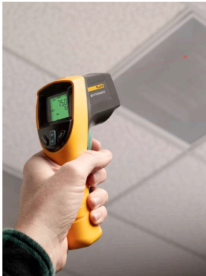
Measuring diffuser temperature.