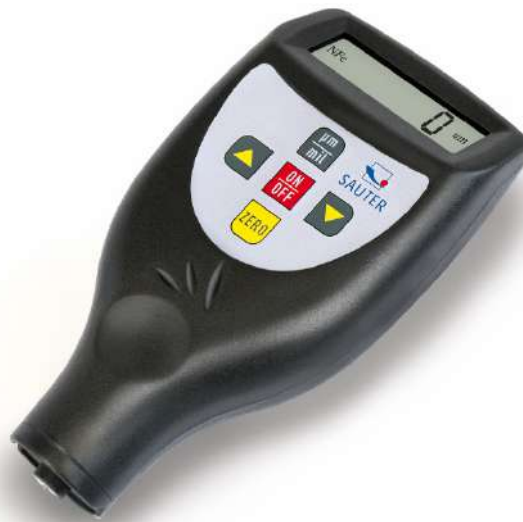
Illustration: TC 1250-0.1FN

Importør: Impex Produkter AS Gamle Drammensvei 107 1363 Høvik www.impex.no info@impex.no Tel.: 22 32 77 20