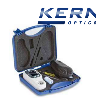
Transport and storage case