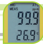
TDS & Temperature (ppm & ppt)