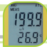
Conductivity & Temperature (µS/cm & mS/cm)