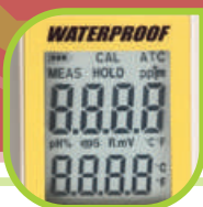
Large Custom Dual-Display LCD