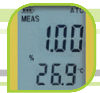
Salinity & Temperature (ppm, ppt & %)