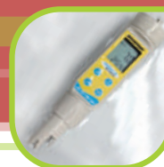
IP67 Waterproof Tester Floats On Water