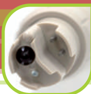
One Sensor Measures Up To 5 Parameters