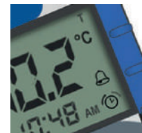
Count-down timer and alarms