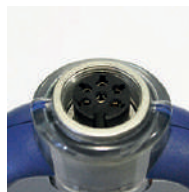
Secure Lumberg Connector

Rugged Waterproof Polycarbonate Case with BioCote® Antimicrobial Protection