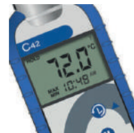
Max/Min feature recalls highest and lowest reading