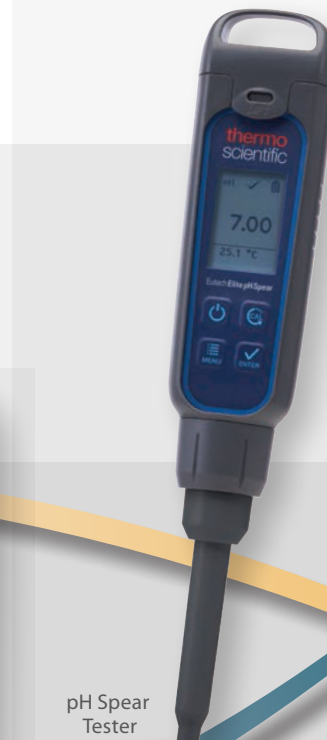
pH Spear Tester