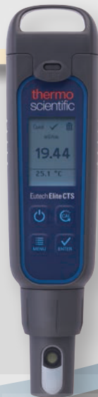
CTS Tester (Cup)