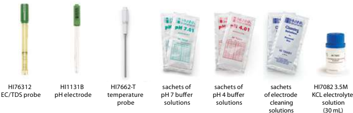
HI76312 EC/TDS probe, HI1131B pH electrode, HI7662-T temperature probe, sachets of pH 7 buffer solutions, sachets of pH 4 buffer solutions, sachets of electrode cleaning solutions, HI7082 3.5M KCL electrolyte solution (30 mL)

HI5521-01 (115V), HI5521-02 (230V), HI5522-01 (115V) and HI5522-02 (230V) also includes: