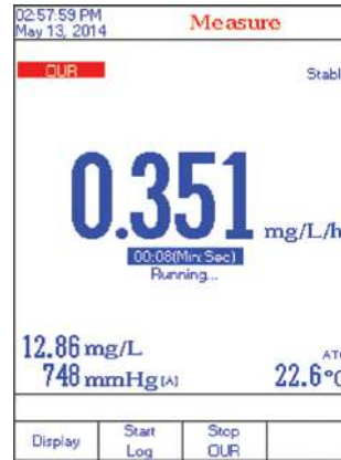
OUR (Oxygen Uptake Rate)