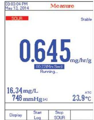
SOUR (Specific Oxygen Uptake Rate)