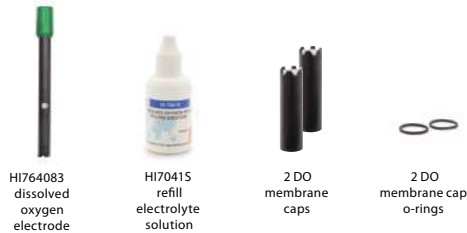
HI764083 dissolved oxygen electrode, HI70415 refill electrolyte solution, 2 DO membrane caps, 2 DO membrane cap o-rings

HI5421-01 (115V) and HI5421-02 (230V) also includes: