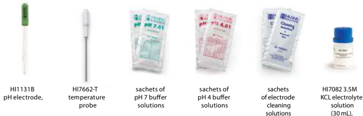
HI1131B pH electrode, HI7662-T temperature probe, sachets of pH 7 buffer solutions, sachets of pH 4 buffer solutions, sachets of electrode cleaning solutions, HI7082 3.5M KCL electrolyte solution (30 mL)

HI5221-01 (115V), HI5221-02 (230V), HI5222-01 (115V) and HI5222-02 (230V) also includes: