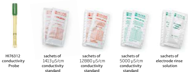
HI76312 conductivity Probe, sachets of 1413 µS/cm conductivity standard, sachets of 5000 µS/cm conductivity standard, sachets of electrode rinse solution

HI5321-01 (115V) and HI5321-02 (230V) also includes: