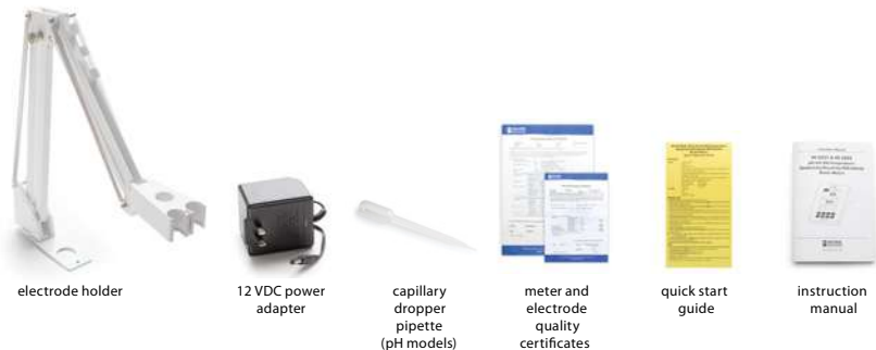
electrode holder, 12 VDC power adapter, capillary dropper pipette (pH models), meter and electrode quality certificates, quick start guide, instruction manual

Impex Produkter AS Gamle Drammensvei 107 1363 Høvik www.impex.no info@impex.no Tel.: 22 32 77 20