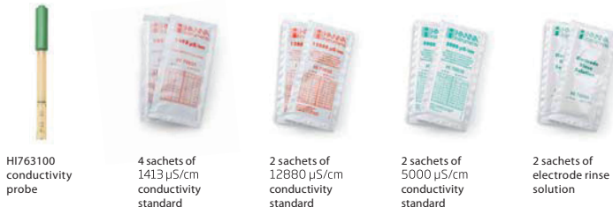
HI763100 conductivity probe

edge®EC: HI2003-01 (115V) and HI2003-02 (230V) also includes: