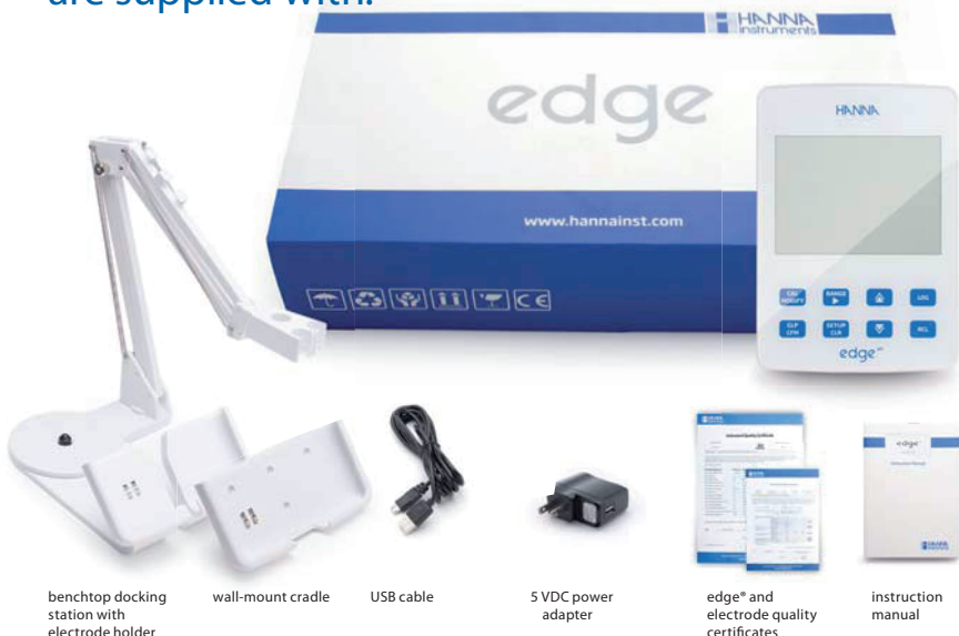
benchtop docking station with electrode holder