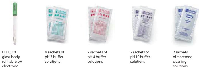
HI11310 glass body, refillable pH electrode

edge®pH: HI2002-01 (115V) and HI2002-02 (230V) also includes: