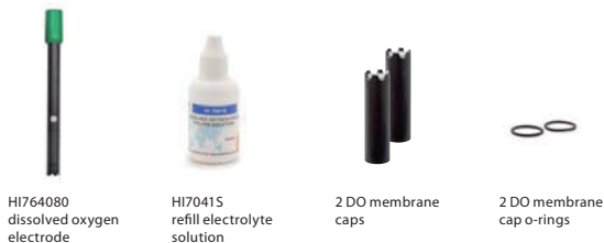
HI764080 dissolved oxygen electrode

edge®DO: HI2004-01 (115V) and HI2004-02 (230V) also includes: