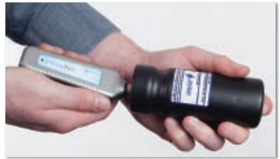
Easy calibration process