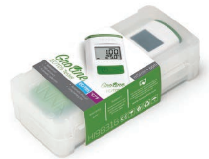
Supplied in a carrying case with calibration solutions.

An easily removable cover provides access to the battery compartment.