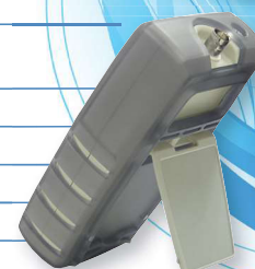
Protective rubber armor with benchtop stand