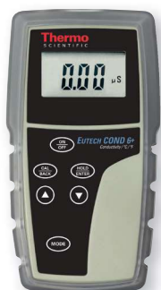
COND 6+ handheld conductivity meter